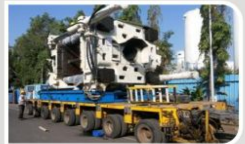
Loading/Transportation of Heavy m/c.

We provide to our clients the quality services for INDUSTRIAL PLANT MACHINERY SHIFTING. We have highly experienced team of professional people handling various type of shifting activities with careful handling of equipment, Machines in small /Large scale industries & MNC's, (complete plant shifting activity in intercity & Intra State). With focus to meet our customer stringent requirements in terms of cost & timely delivery, for this we are appreciated by our many customers.