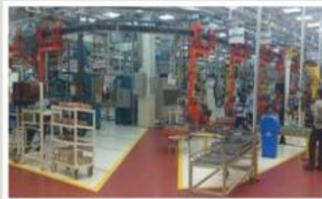
Engine J Bar Assembly Shop.