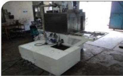
Industrial Washing m/c