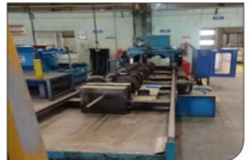
Special Purpose Machine