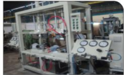
Leakage testing machine