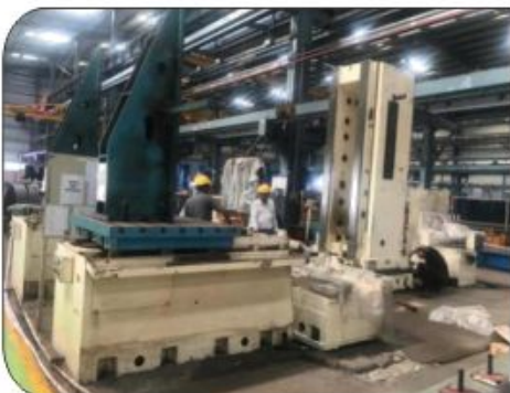
Horizontal Boring Machine