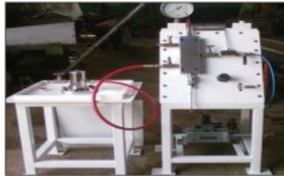
Valve Leak Testing m/c