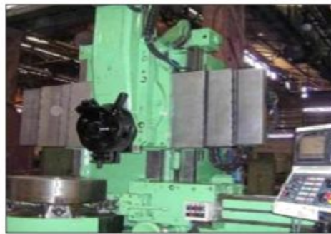
Vertical Turret Lathe