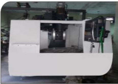
Vertical Machining Center