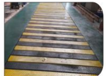
Medium And Heavy Fabrication