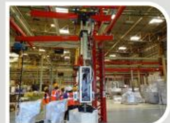
Assembly Line Installation