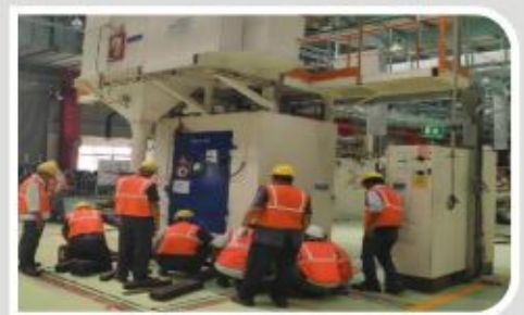
Machine Shifting using Skaters