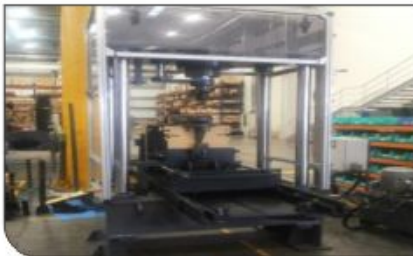
Design & Supply Hydraulic Press