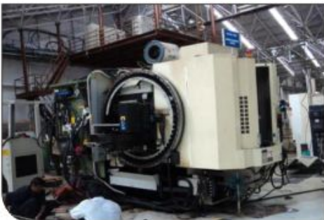
Horizontal Machining Center