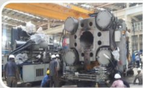
Injection Molding m/c