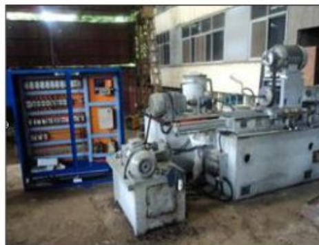
Special Purpose Drilling Machine